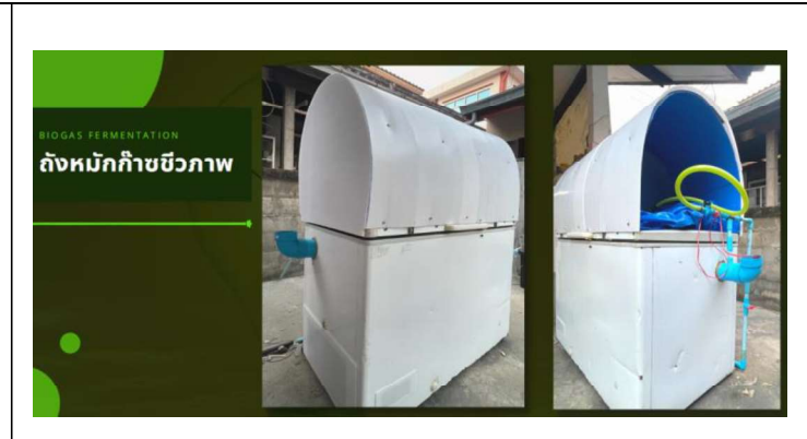
The development of Biogas Fermentation that is suitable for household use (UBRU, Thailand)