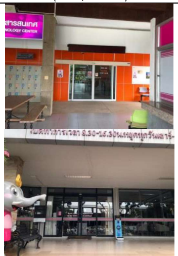
Automatic slide doors (UBRU, Thailand)