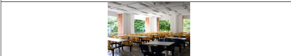
Outdoor seating for students is adequate.