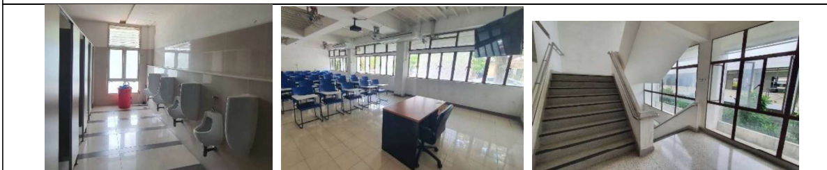
Visual Comfort Using Natural Light Design (ARU, Thailand)