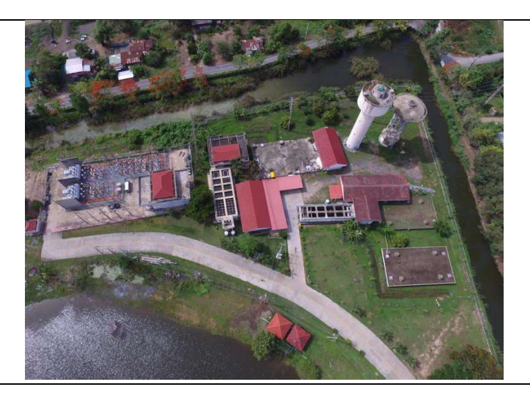
3. Examples of waterways found all around the campus

2. Natural lakes and rivers interconnecting waterways across the campus, wholly for water conservation